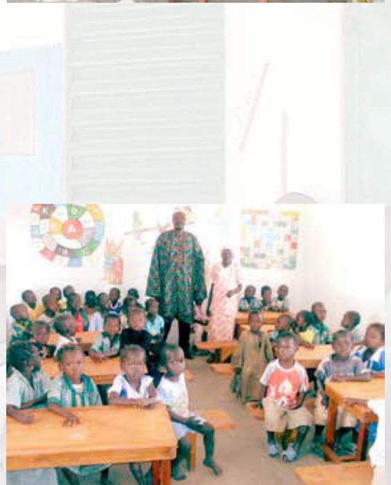
Viel bewegt mit dem Einsatz der Schule „Am Schloß“ in Bützow.