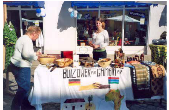
Presentation at Stadtfest 2005 in Bützow

We gave a new coat of paint to the classrooms, paid the wages to the teachers and organised a trip to the sea for the children who were looking forward to this trip for long.